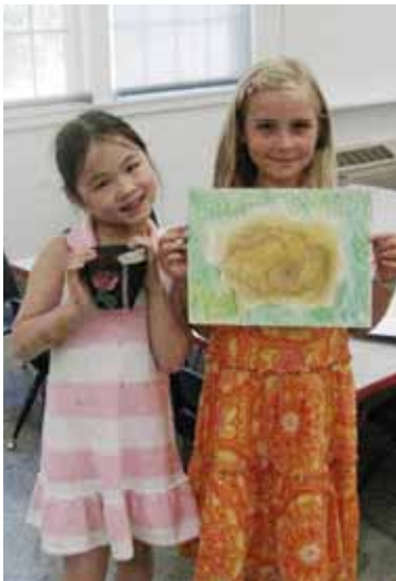
Afterschool ArtShop students display their finished art projects.

Magnet School; in Groton, Northeast Academy, Fitch Middle School, Fitch High School, Claude Chester; in Stonington, Dean's Mill, the YMCA, Denison Pequotsepos Nature Center Pre-school, West Vine Street School, and Stonington Free Library; and John B. Stanton Elementary, Wequonnoc Elementary School (Norwich), Gallup Hill School (Ledyard), Griswold High, and Old Lyme High.