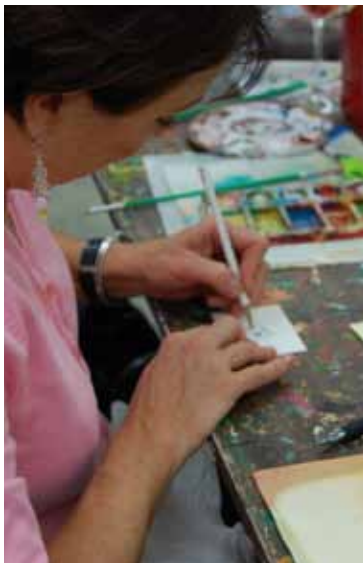
A student focuses on her art project at an Artini Hour event in the studio.