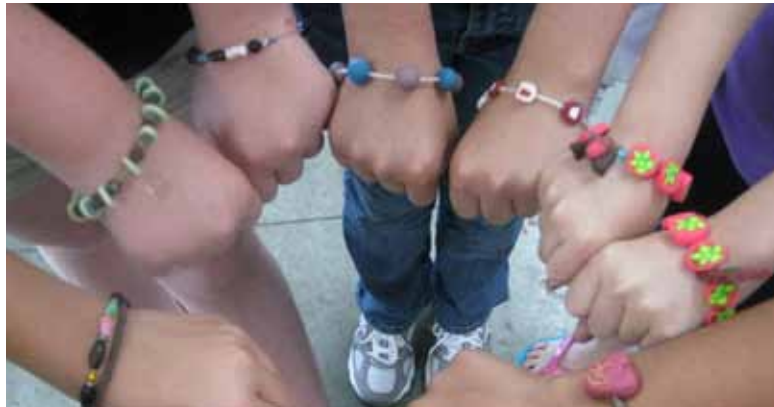
Students show off their Sculpey bracelets, made at Summer Camp 2010.

Magnet School; in Groton, Northeast Academy, Fitch Middle School, Fitch High School, Claude Chester; in Stonington, Dean's Mill, the YMCA, Denison Pequotsepos Nature Center Pre-school, West Vine Street School, and Stonington Free Library; and John B. Stanton Elementary, Wequonnoc Elementary School (Norwich), Gallup Hill School (Ledyard), Griswold High, and Old Lyme High.